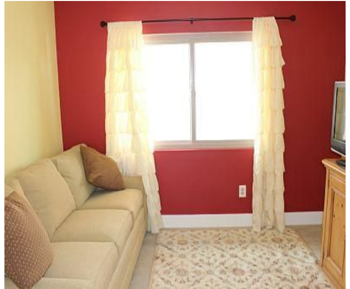
Den with Sofa Bed - Upstairs