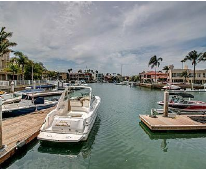
Mesmerizing private 3 channel view

Recommended for: Girls getaway, Tourists without a car, Adventure seekers, Age 55+, Romantic getaway