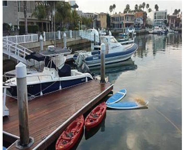
Walkway to Boat docking area