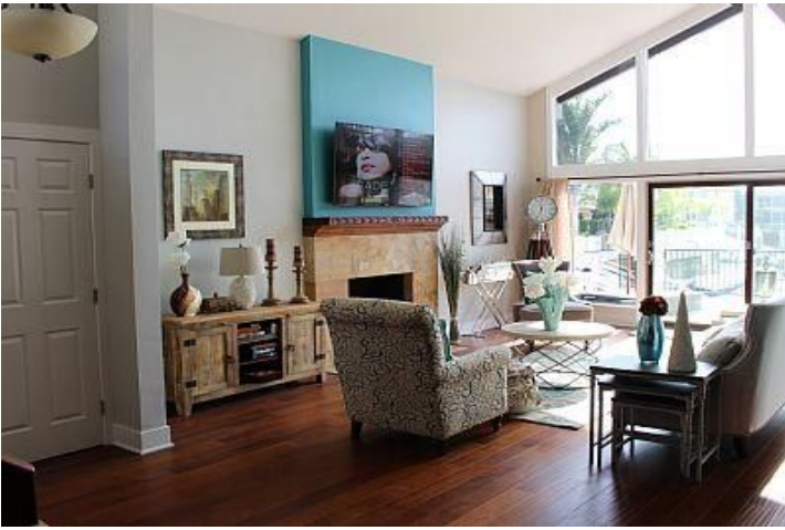
Living / Family Room