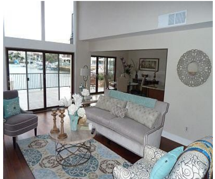
Living / Family Room