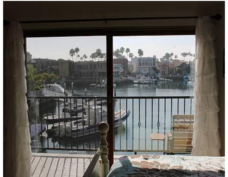
Master Bedroom Window/Balcony