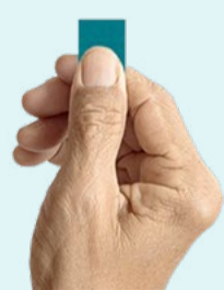
KYNMOBI™ (apomorphine HCl) sublingual film not actual size

KYNMOBI™ (apomorphine HCl) sublingual film 10 mg • 15 mg • 20 mg • 25 mg • 30 mg